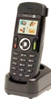
Wireless Model Available in all schools for admin and staff use (ie. Playgrounds, hallways, etc...)