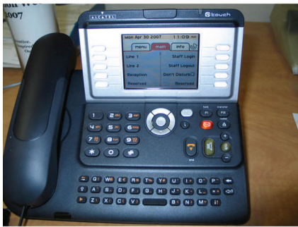
Basic Desktop Model Available in all classrooms and offices

7500 Students 900 Staff 26 Schools + 5 Colony Schools 5944 km 2